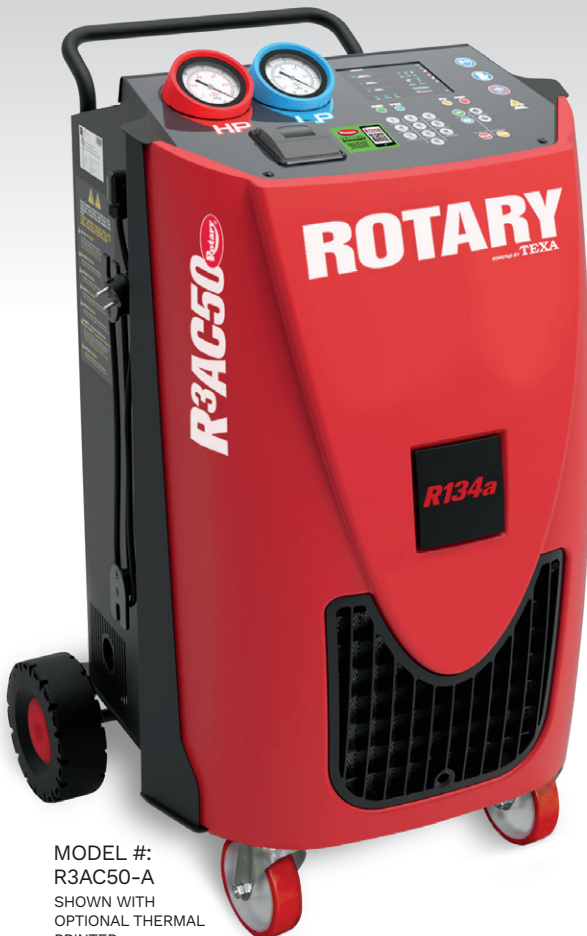
MODEL #: R3AC50-A SHOWN WITH OPTIONAL THERMAL PRINTER.