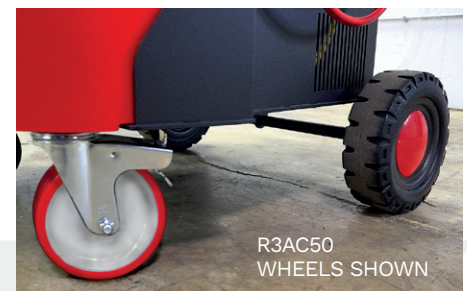
R3AC50 WHEELS SHOWN

Machines can be equipped with a thermal printer to print reports of the work performed. Reports list critical information such as the quality of the refrigerant recovered, and the final pressure in the A/C system after recharging.