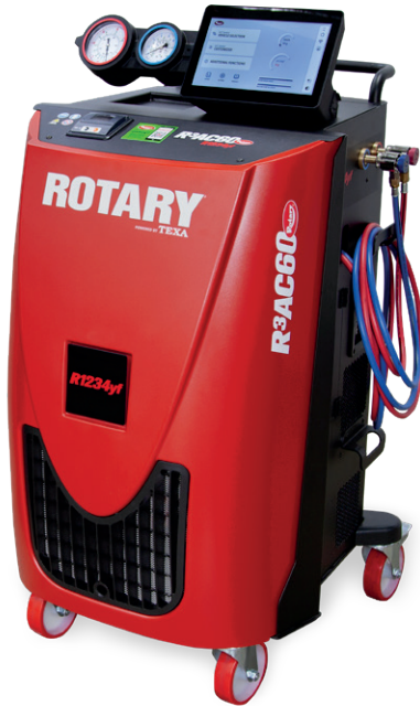
MODEL SHOWN: R3AC60-YF WITH OPTIONAL THERMAL PRINTER

LOADED WITH TECHNOLOGY REQUIRING JUST A TOUCH FOR RECHARGING.