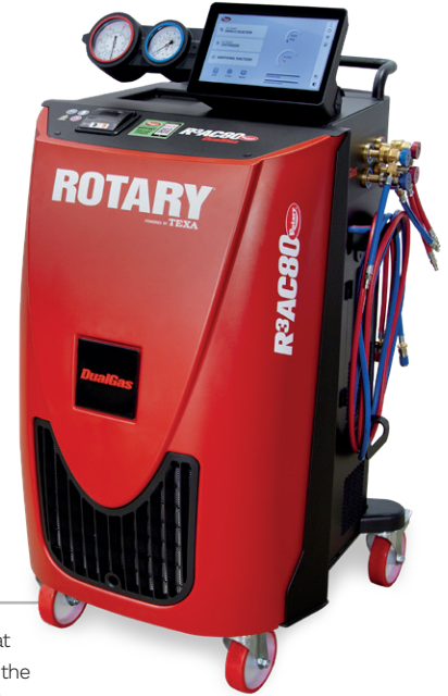
MODEL SHOWN: R3AC80-AYF DUAL GAS SYSTEM WITH OPTIONAL THERMAL PRINTER

The R3AC80 is one of the few machines that offers an air condition recharge station that works with both the older R134a and the new R1234YF refrigerant at the same time, on the same machine, without changing tanks. Equipped with two separate tanks and circuits so within minutes you can switch between servicing vehicles with different refrigerants without the need to swap tanks. It identifies the incoming gas and purges automatically , if required.