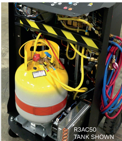
R3AC50 TANK SHOWN

Evaporator increases the speed and efficiency of the reclamation process, saving you time and money.